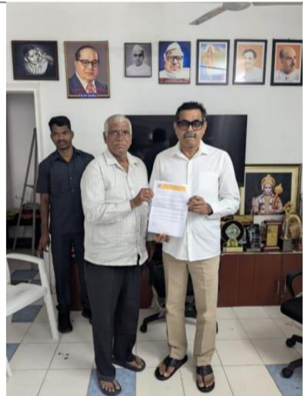
Representation submitted to Sri Shri Konda Vishwashwar Reddy ji, Honourable Member of Parliament (Lokasabha), Chevella Constituency