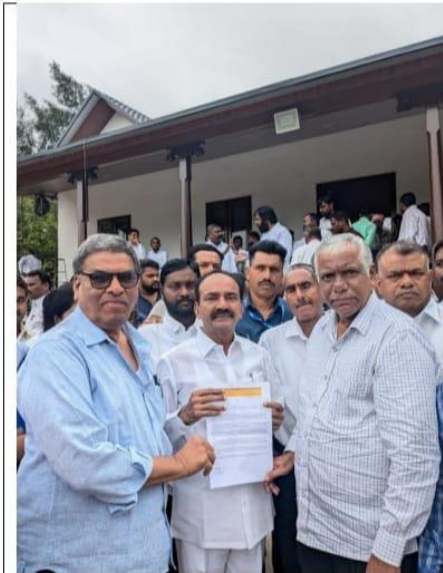
Representation Submitted to Sri Etala Rajender ji, Honourable Member of Parliament, Medchal Malkajiri Constituency.